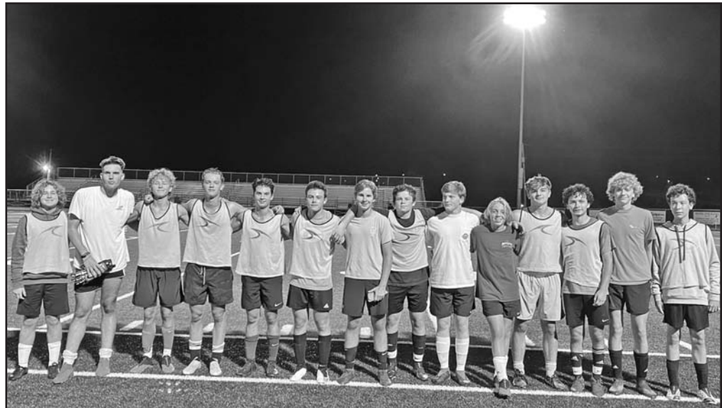
The Union County High School soccer team won the October fundraiser tournament at Mike Colwell Memorial Stadium last weekend.