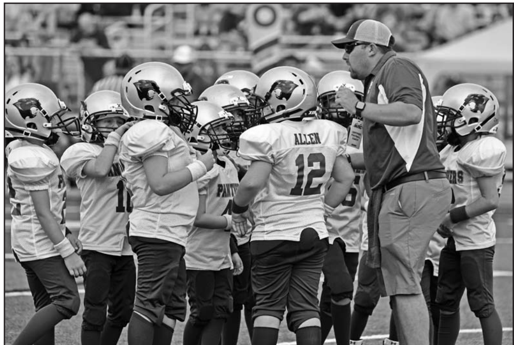
Union County youth football will host White County on Saturday morning at Mike Colwell Memorial Stadium in the final weekend of the 2021 Mountain Athletic Conference regular season. The gridiron action gets underway at 9 a.m.